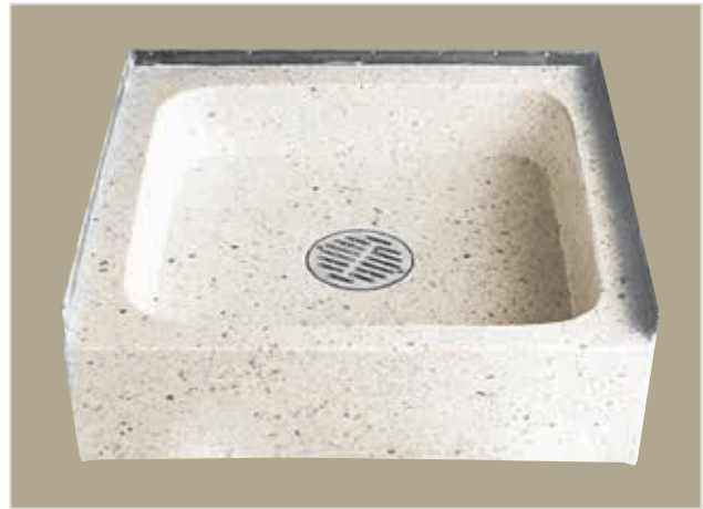
Shown: Model 40

FLORESTONE PRODUCTS CO., INC. 2851 Falcon Drive • Madera, CA 93637 T. 559.661.4171 • T. 800.446.8827 F. 559.661.2070 • florestone.com