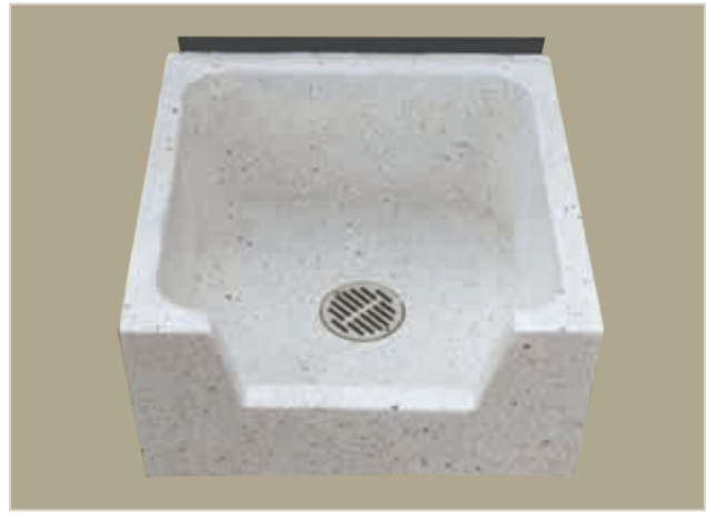
Shown: Model 90

2851 Falcon Drive • Madera, CA 93637 T. 559.661.4171 • T. 800.446.8827 F. 559.661.2070 • floestone.com